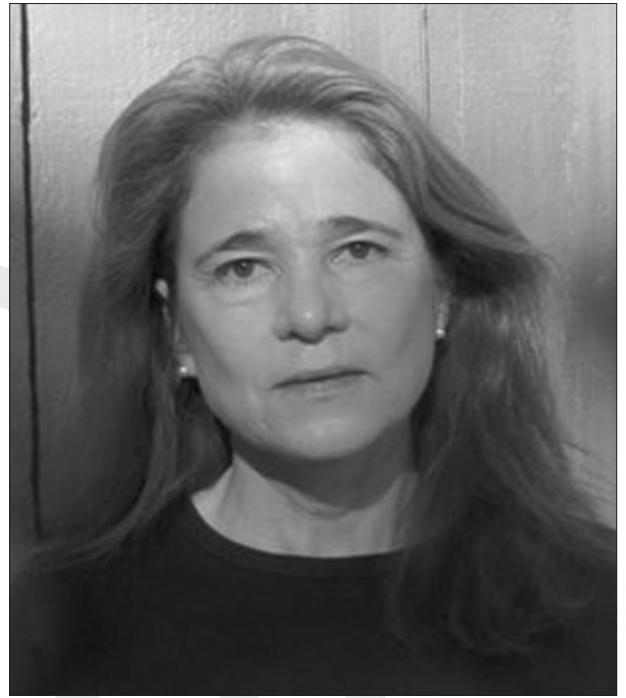
NEED PHOTO CREDIT

That dark room in which we finally spoke.